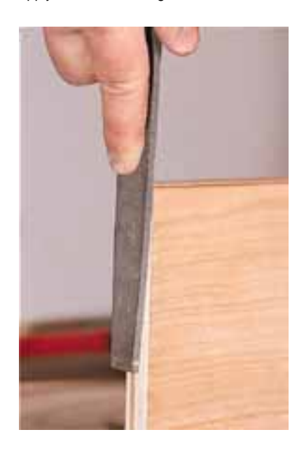
To trim the long edges of the veneer tape,

To trim the edge, start by carefully bending over the ends until the veneer breaks. Make sure you apply pressure to the end of the attached veneer so it doesn't splinter back onto the visible edge. Then pull the "dangling chad" of veneer downward to tear it free. By the way, if you're doing four edges of a board, do two opposite edges first, trim the edges, then apply the other two edges.